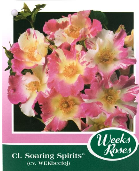
Cl. Soaring Spirits™ (cv. WEKbecfoj)