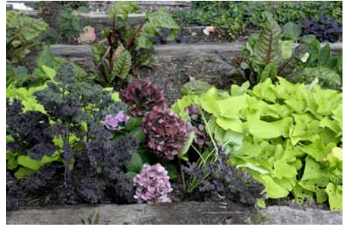
ABOVE: A colorful mix of edible and ornamental plants.