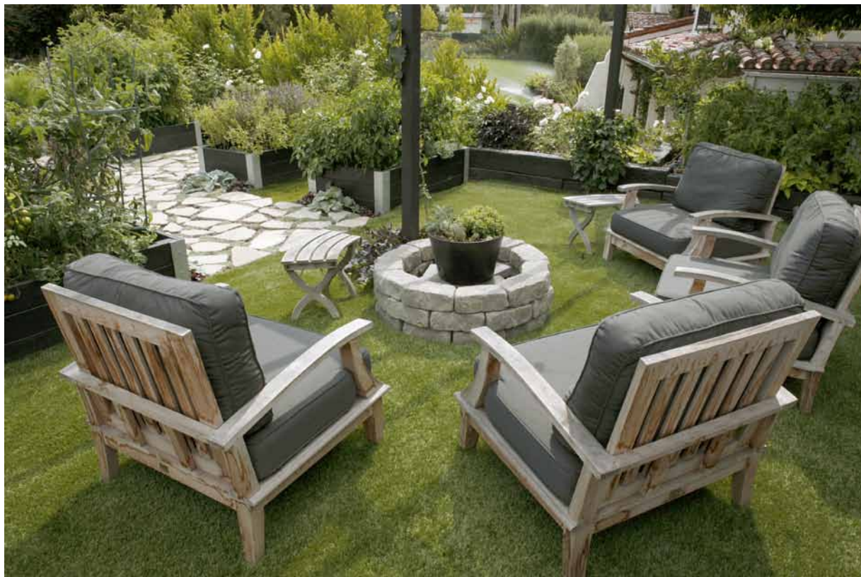
Comfortable chairs grouped in the dappled shade of the front yard allow adults to socialize while children play.

The garden was on the 2012 Sherman Gardens and Library tour, and the project evolved into the founding of "Dirty Girl Garden Design."